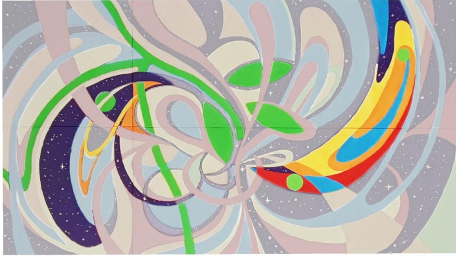
Impressions of fish