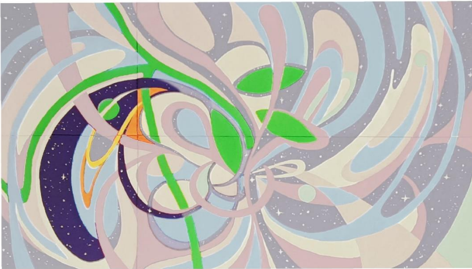
superimposed eagle head